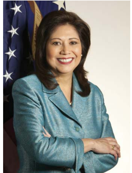
Hilda L. Solis, Secretary of Labor

"As this Congress winds down, the tremendous need for this legislation continues. Every day the lives of miners are needlessly being put at risk. That should be unacceptable to every single member of Congress.