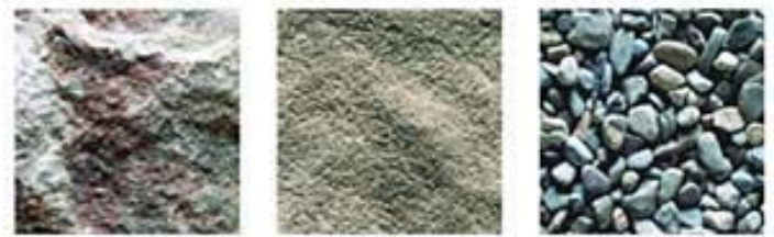
Natural building blocks for quality of life